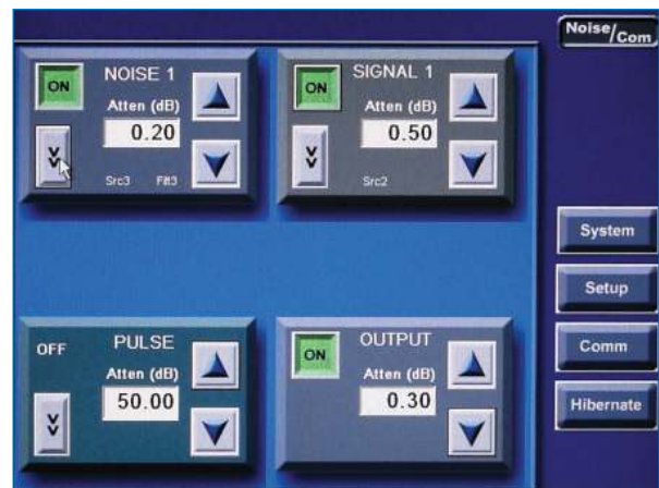
Intuitive standard control menu