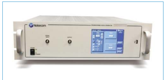
3U High - U7opt18

Wireless Telecom Group Inc. 25 Eastmans Rd Parsippany, NJ United States Tel: +1 973 386 9696 Fax: +1 973 386 9191 www.noisecom.com