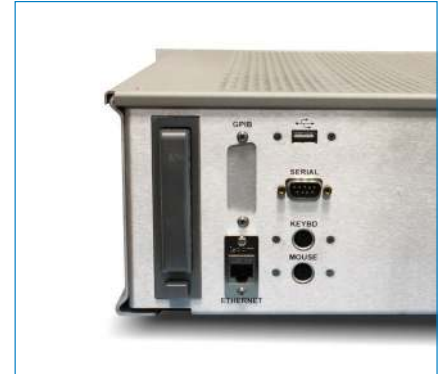
Removable drive - U7opt17